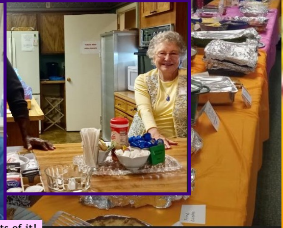
Lots of it!