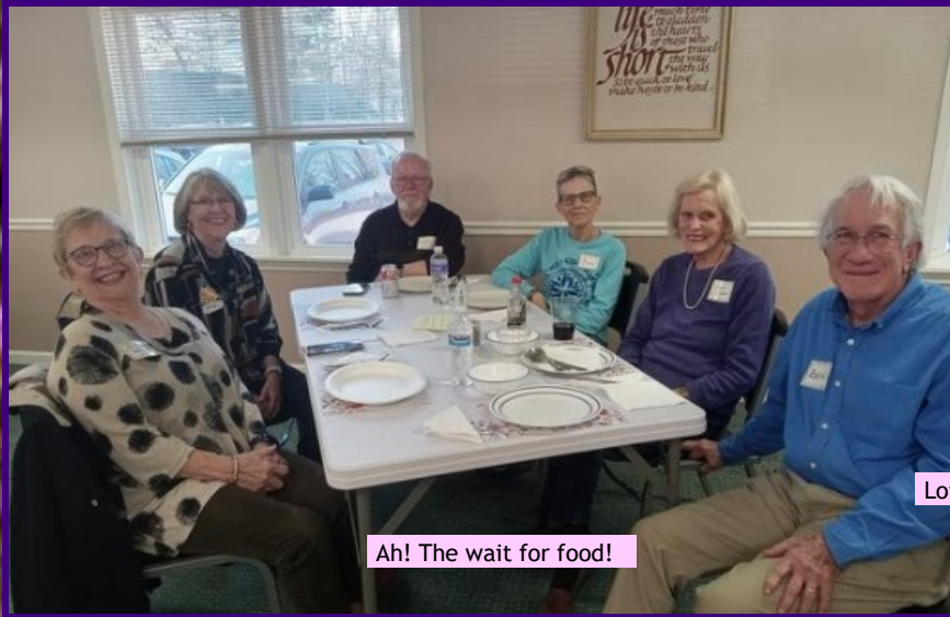
Ah! The wait for food!