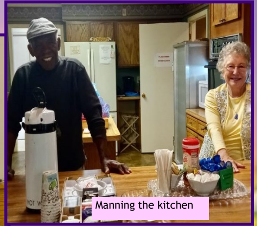
Manning the kitchen